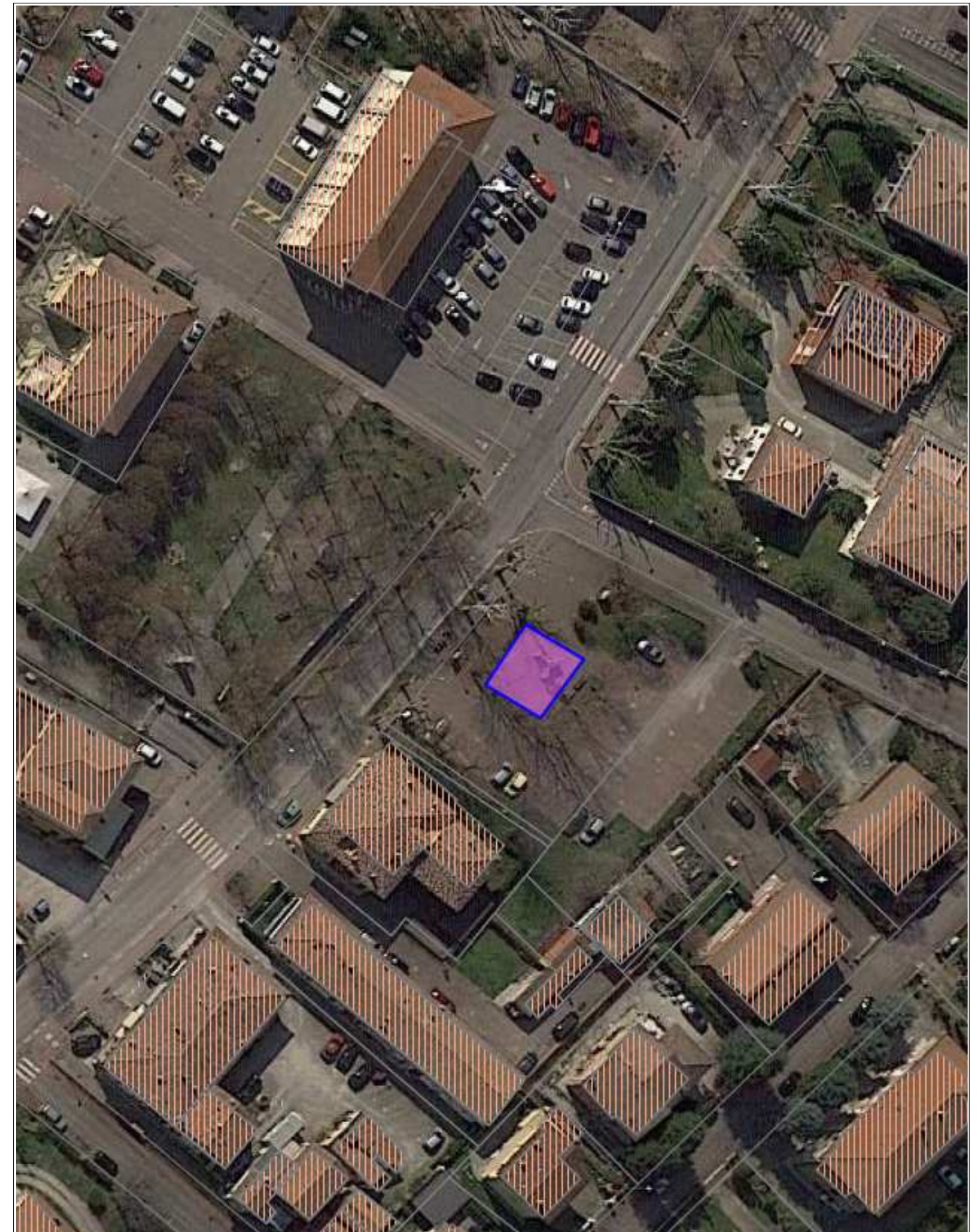
Inquadramento dell'area su ortofoto